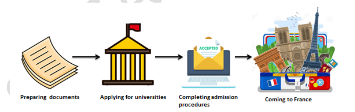
Fig. 1: Admission process

Living in France can be a lot more fun and easy if you know how the French system works beforehand. That is why I decided to write this document so that the readers would not have to deal with any of the major issues I encountered. The following is a simplified depiction of the entire admissions process: